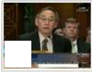
Department of Energy 2012 Budget Senate Committee May 18, 2011