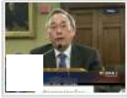
Energy Department Fiscal Year 2013 Budget Senate Committee Feb 28, 2012