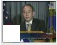
Department of Energy Fiscal Year 2013 Budget News Conference Feb 13, 2012