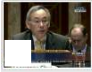
Energy Department Fiscal Year 2013 Budget Senate Committee Feb 16, 2012