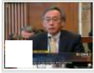
Department of Energy 2012 Budget Senate Committee Feb 16, 2011