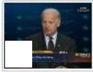
Stimulus and Energy Programs White House Event Apr 21, 2010