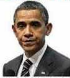
B. Hussein Obama